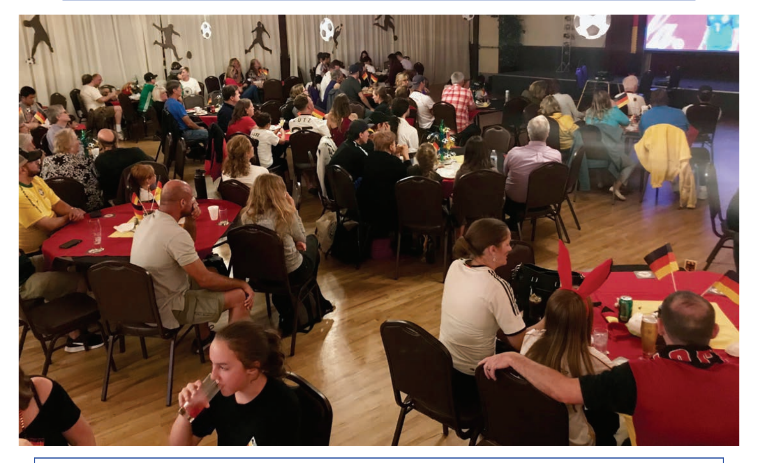
Super fun decorations for the World Cup Soccer Games